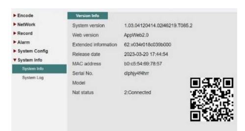
Figure 3.6 System Info

information, browse device Choose "Configuration", go to "System Info" A version and system information page is displayed as shown in the figure 3.6.