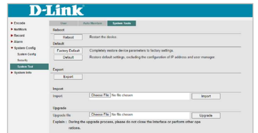
Figure 3.8 Camera Maintenance

When you click on the reboot option, device is restarted or reboot successfully.