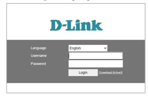
Figure 3.1 Login Page

Step 3 Click on the Login in button , then the main page is displayed.