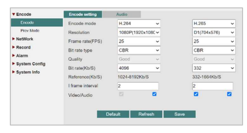
Figure 3.7 Stream

"Configuration>Encode >Encode Settings, the stream page is displayed, as shown in the figure 3.7 below.