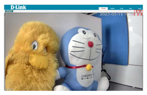
Figure 3.5 Live Video

To browse a real-time video, click on preview. The Live Video page is displayed with option of, as shown in figure 3.5.